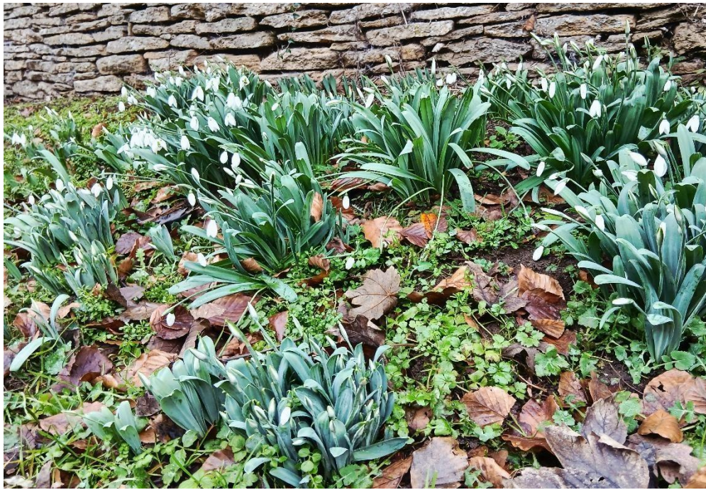
Snowdrops (see more below)