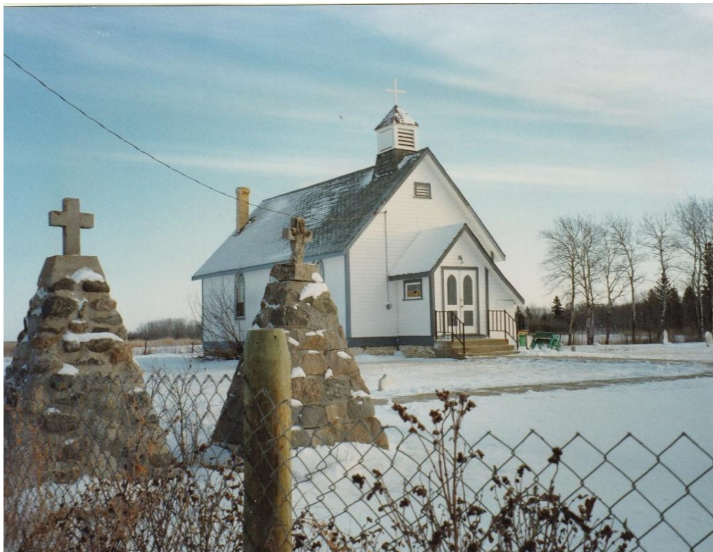
St. Helen's Anglican Church, Fairford, Manitoba in 1993-94.

Happy Christmas from Fairford History Society.