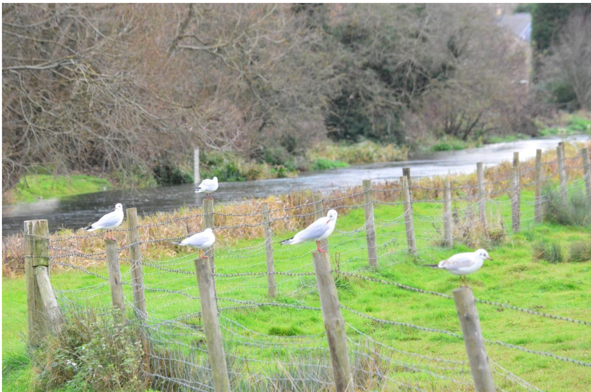
A seagull meeting alongside the river

Let's start an epidemic quick and get the world infected.