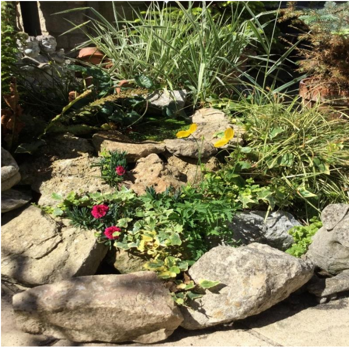
A touch of Spring

Loving Father, thank you for the blessings that come from setting aside time to read your word and pray every day. Teach us Lord to trust in your unfailing love. Help us to see those around us who need lifting up and give us the ability we need to do that, for the glory of the name of Jesus, AMEN